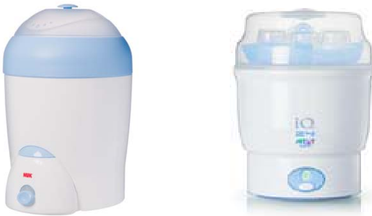
Figure 3. Baby bottle steam sterilizers can be used for eFlow handsets and jet nebulizers.